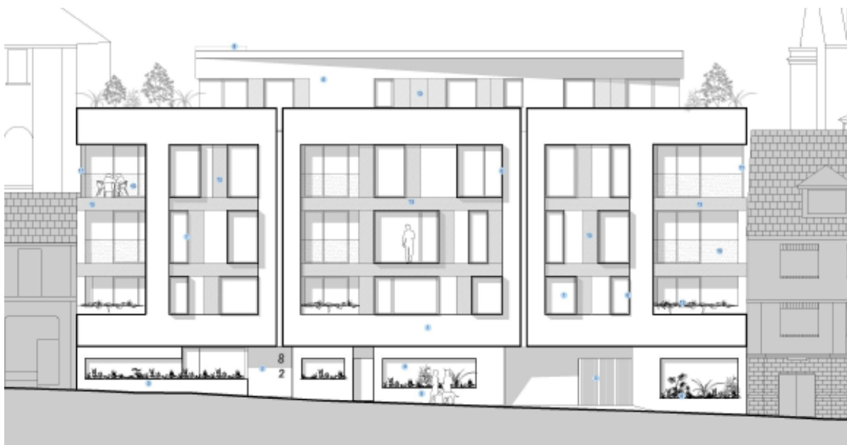
(Figure 2 – Tontine Street Frontage)

3.1 Full planning permission is sought for the erection of a part 5-storey and part 3-storey building comprising 45 apartments with associated access, parking and communal garden. The development would have a dual aspect and would be up to 5-storeys fronting Tontine Street (Fig.2) and up to 3-storeys fronting St Michael’s Street (Fig.3). A landscaped courtyard is proposed to the first floor and a raised podium garden is proposed which would have seating and raised planters with trees.