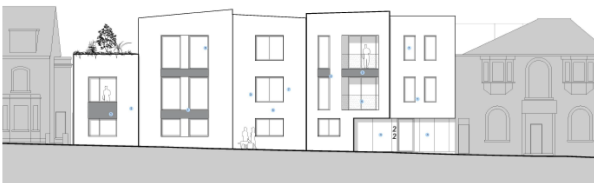
(Figure 3 – St Michael Street Frontage)

3.2 The scheme has been amended during the process of the application and has been reduced from 50 to 45 flats and reduced from 6-storeys to 5-storeys fronting Tontine Street. The apartments would consist of 8 x studios, 31 x 1 beds and 6 x 2 beds