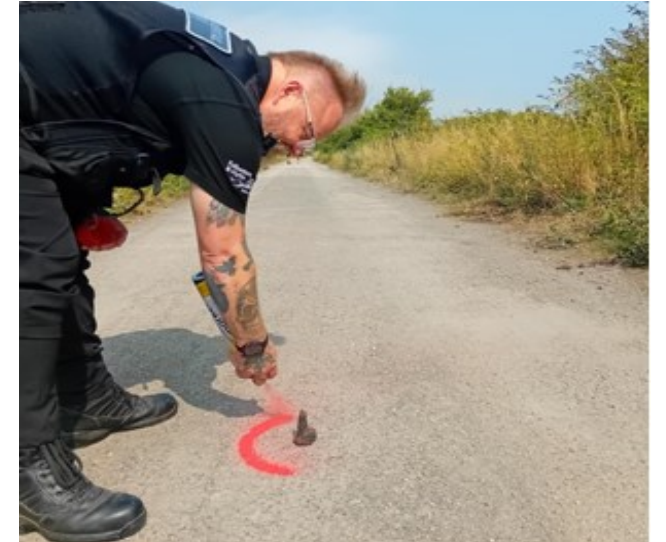
Environmental Enforcement Officer on patrol at The Warren, Folkestone