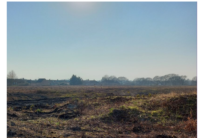
The Biggins Wood site in Folkestone will see new affordable homes and employment space delivered.