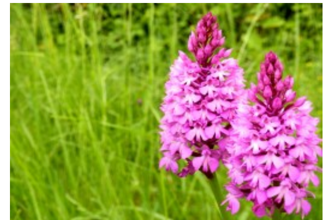
Rare and distinctive pyramidal orchid found near the Royal Military Canal in Hythe