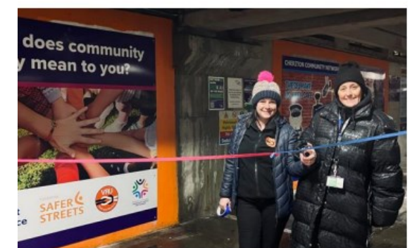
Sandgate Road Car Park Artworks