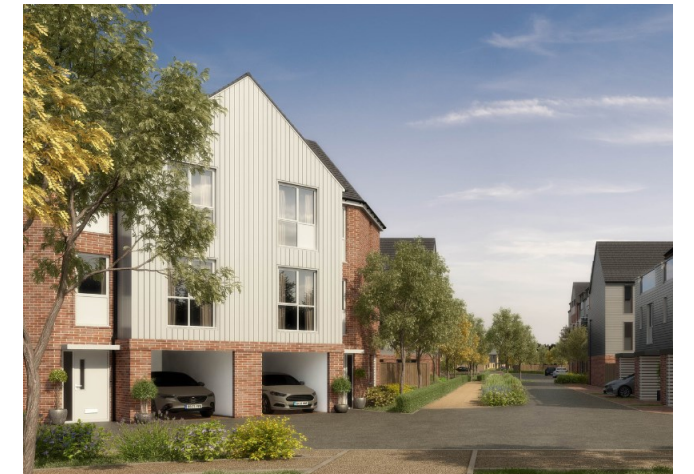
Approval of 26 new green homes to be built at Boundary Road in Hythe