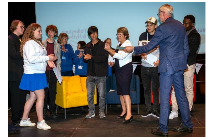
Excellence in Volunteering Awards celebrates the contribution volunteers make daily in local communities