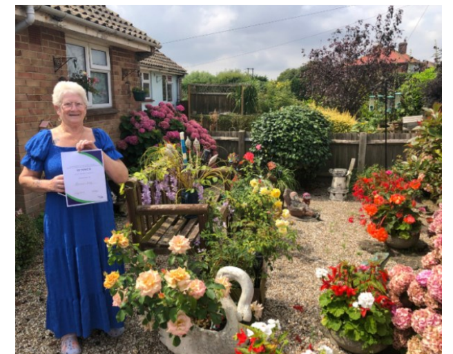
Tenant with an award for her front garden as part of the annual gardening competition managed by STAP.