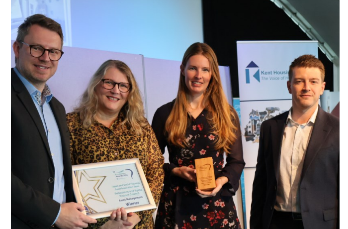
Housing Award for leading a decarbonisation project to improve the energy efficiency of council-owned homes.

No use empty scheme: In February 2025, a building which was left to decay for nearly two decades has been refurbished thanks to the support of a council initiative. Five new flats have been created in the five-storey town house located in Augusta Gardens, Folkestone, following three years of work by Browns Construction – backed by the No Use Empty scheme. Now in its twentieth year, the Kent County Council-led programme helps fund the renewal of derelict properties by bringing them back into residential use. Folkestone & Hythe District Council was one of its founding partners and, in 2014, introduced top up loans to help tackle some of the