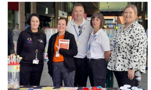
Operation Sceptre with multi-agency partners