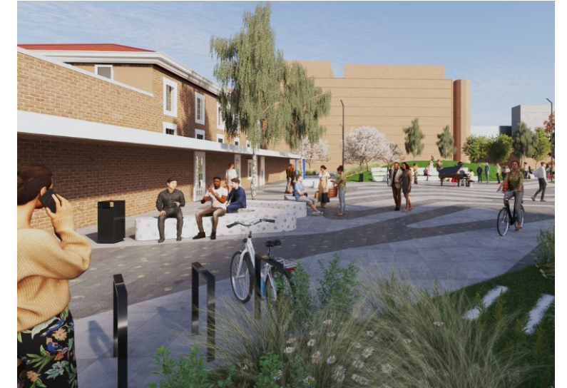
Artist impression of Bouverie Square as part of the wider regeneration relating to the 'Folkestone -A Brighter Future' project

Engagement with Local schools: During the year the council has engaged positively with local schools to support pupils to access jobs, both at the Council and beyond. We have produced a short video and worksheet on interview techniques for local young people and distributed this via schools, colleges and the Family Hub. We have worked with the Beacon school running practice interview sessions and delivered a workshop on interview skills for Year 10 pupils at Folkestone School for Girls. We have run careers events at The Marsh Academy, Folkestone School for Girls, Folkestone College, and at the Council (attended by Folkestone College, William Harvey Grammar School and Birchwood School). We also had a stand at the Romney Marsh Inspires careers event for the Marsh Academy and The Lighthouse. In addition to this, we supported the drop in event for former Folkestone Sports Centre employees providing advice on training opportunities, applying for jobs and interview skills.