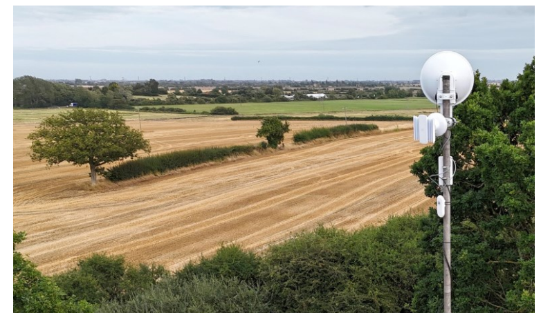
Expansion of 5G wireless broadband on Romney Marsh thanks to the support of the Rural England Prosperity Fund.