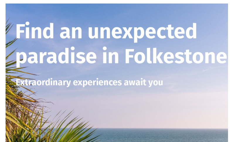
A new tourism campaign aimed at attracting even more visitors to our amazing district