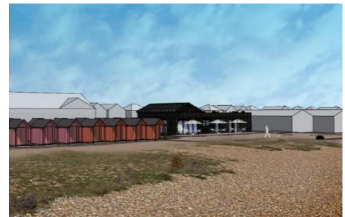
Plans for a new visitor hub, improved water sports facilities and 93 beach huts at Greatstone were approved in the year