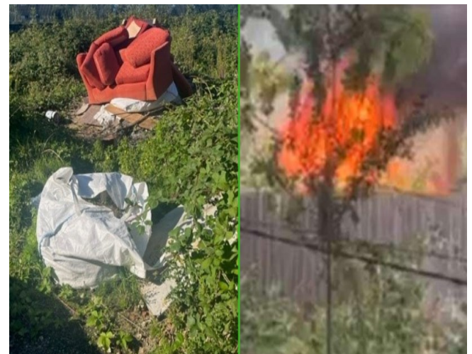
A man burning waste on private land in Folkestone found guilty of fly tipping resulting in a £464 fine.