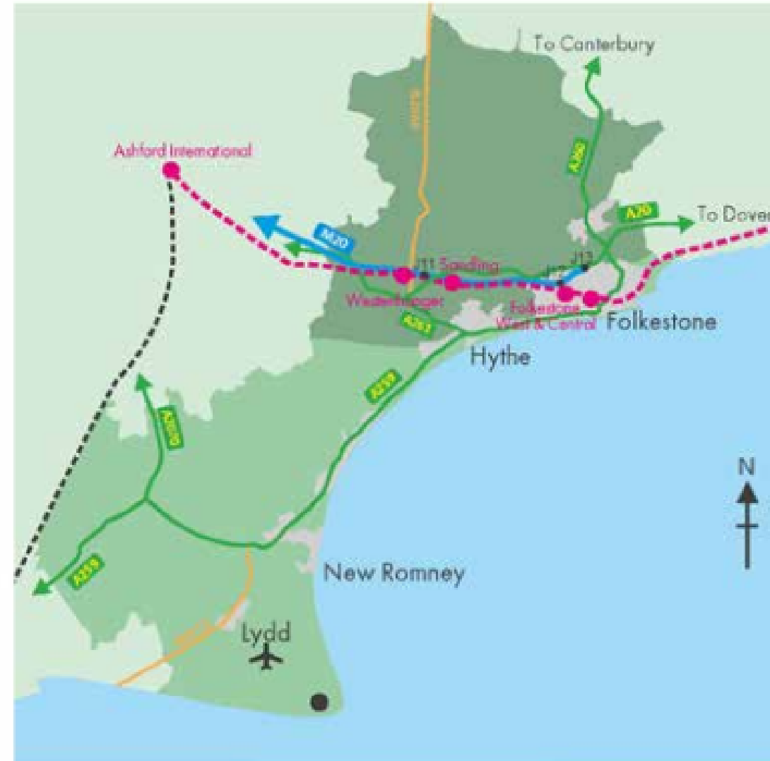
Folkestone & Hythe District

13.4% in the tourism sector 12.3% in the knowledge economy 8.7% in the creative sector, growing almost 7% over the last 5 years 5.2% in food and drink production 4.8% in manufacturing