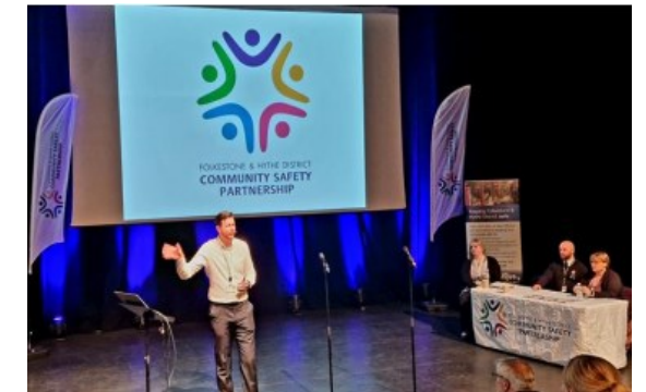
Community Safety Partnership Annual Event