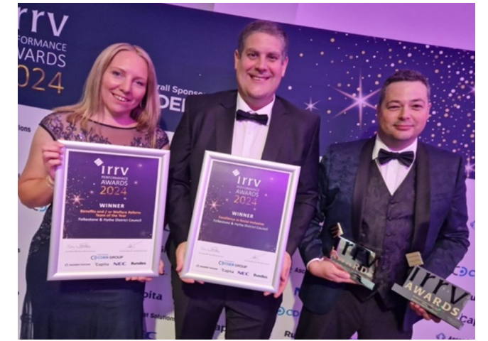
Council Tax, Benefits and Welfare Team winning at the IRRV National awards ceremony

Drop-in event for Folkestone Sports Centre staff: Following the closure of Folkestone Sports Centre in July 2024, due to the Charity running the centre calling in the administrators, the council hosted a drop in event at the Civic Centre for sports centre staff affected by the closure on 9th August 2024. The staff were able to talk to members of the council's welfare team and guidance was given around sources of assistance. In addition, there was advice on training opportunities, applying for jobs and support offered around interview skills. Staff from the Department of Work and Pensions and East Kent College were also in attendance at the event to give advice.