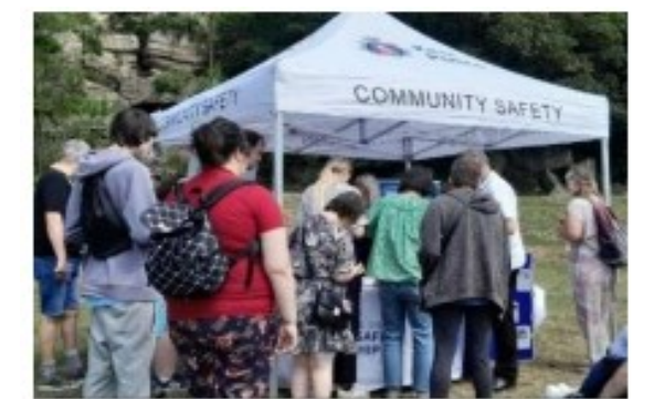
Summer Safety Event in the Coastal Park