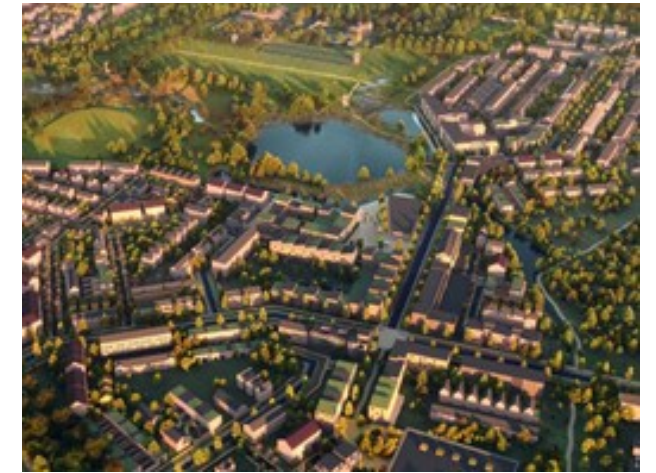
Collaboration with Homes England on bringing forward new homes at Otterpool Park was agreed in the year.

Net zero pathway at Otterpool Park: In February 2025, A proposal aimed at providing sustainably sourced energy for new homes and businesses planned at Otterpool Park was approved by Folkestone and Hythe councillors. The council's Cabinet supported the "pathway to net zero" by agreeing that a renewable energy company take on the role of bringing forward a sustainable power supply scheme and obtaining the necessary planning consents. The proposal from SNRG to create on-site electricity generation via roof-top solar and a solar park with battery storage, all connected via a smart grid. It is estimated that 50% of the average annual demand of the 8,500 homes planned for the new town could be generated on site with the remainder coming from suppliers of renewable energy via the national grid making the new town net zero in operation. The company will fund, own and operate the solar park and its connection to the smart grid. It will also remain fully accountable for servicing the investment, delivery, performance, compliance, customer satisfaction and all financial transactions. The council will have no ongoing financial liability.